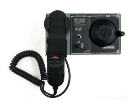
Size (WxHxD): 220 x 222 x 185 mm (w/handset) Weight: 2.4 kg