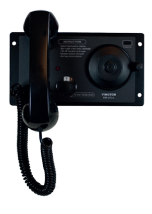
Size (WxHxD): 238 x 214 x 137 mm (w/handset and built-in depth) Weight: 1.3 kg